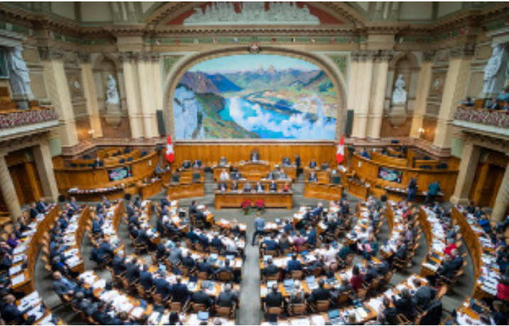
Federal Assembly inside the Swiss Parliament, Bern