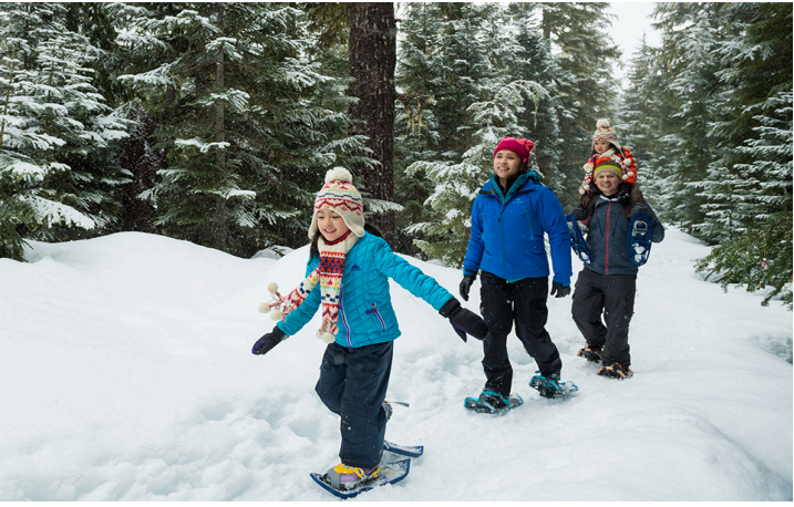
Snow-shoeing, a typical Swiss winter sport in the moutains