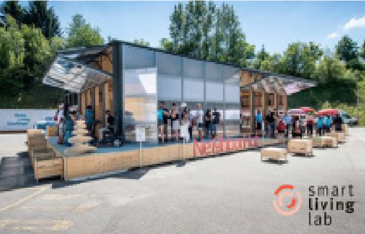
Smart Living Lab in the Blue Factory, the innovation/start-up coumpound, Fribourg