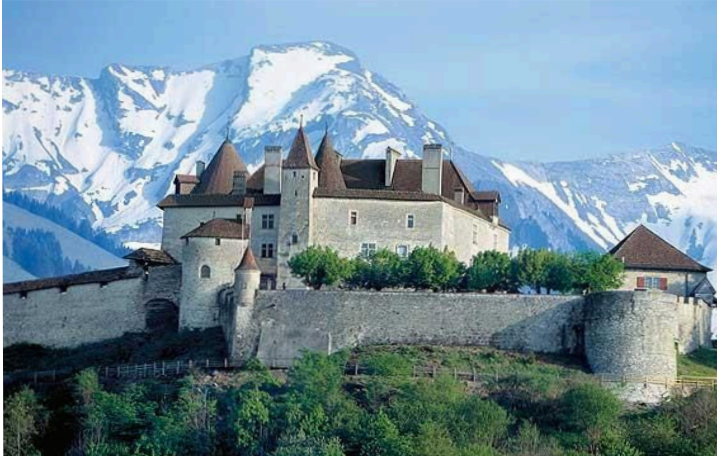
Gruyères Castle, Fri-bourg