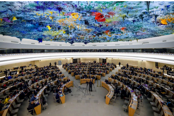
The ceiling of the Palais des Nations, in the United Nation Office in Geneva