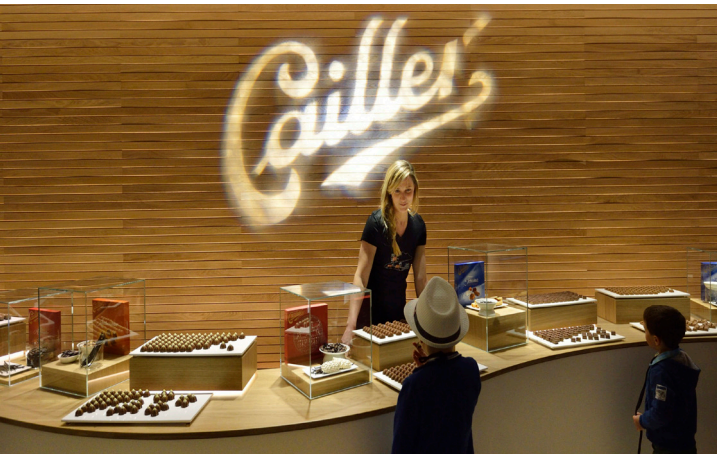
Tasting room in the Cailler Chocolate Factory, Fribourg